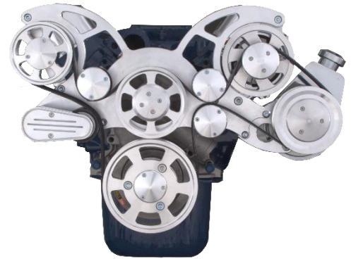
With Saginaw Pump

Step 13: Route the belt based on your configuration above. Recommended belts for proper tension are as follows: