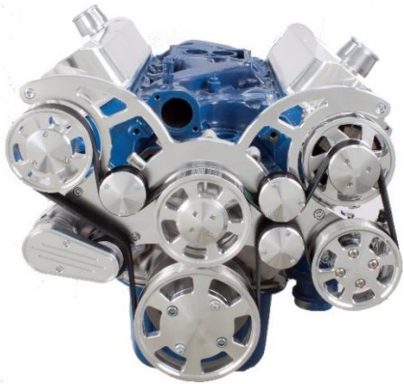
With Power Steering