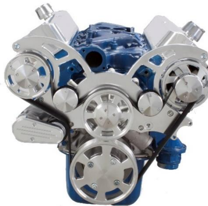
Without Power Steering