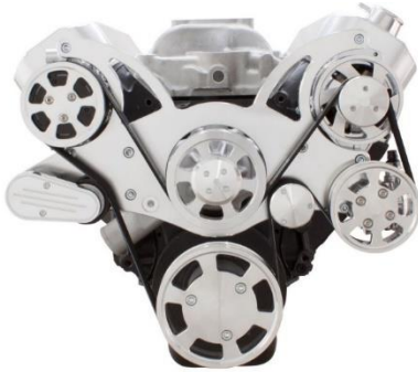
With Power Steering