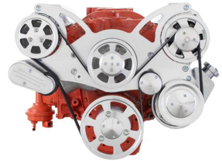
With Saginaw Pump