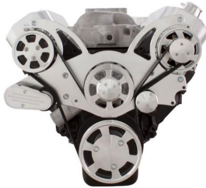
Without Power Steering