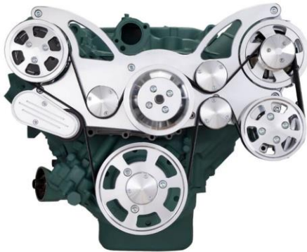
With Power Steering