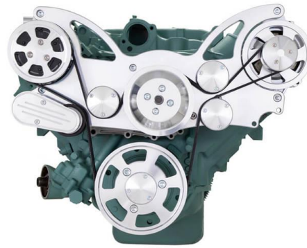
Without Power Steering

Step 13: Route the belt based on your configuration above. Recommended belts for proper tension are as follows: