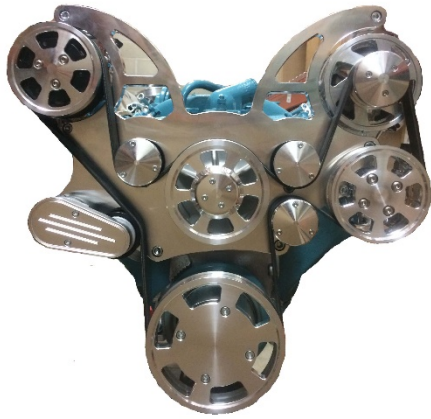
With Power Steering