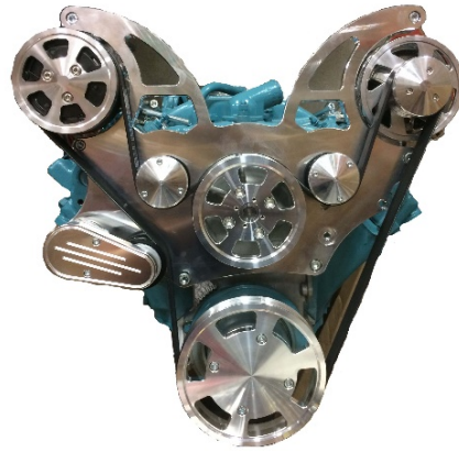
Without Power Steering

Step 13: Route the belt based on your configuration above. Recommended belts for proper tension are as follows: